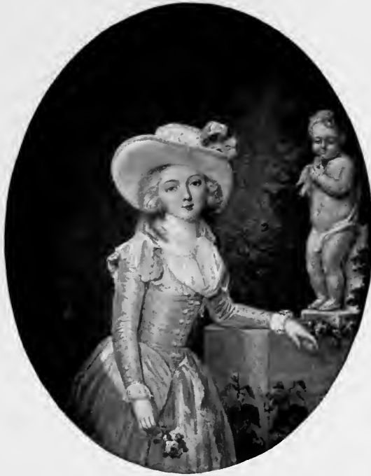
A GRAND-DAUGHTER OF NATTIER, THE ARTIST BY LOUIS SICARDI